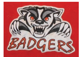
New York Badgers