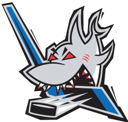
New Jersey Landsharks

The no-check, round robin, 4-on-4 Tournament is scheduled to last through tonight, until 6 am, tomorrow morning, here at the Palisades Center Ice rink. This year's tournament involves six teams with players from Northern New Jersey, Rockland, and Westchester.