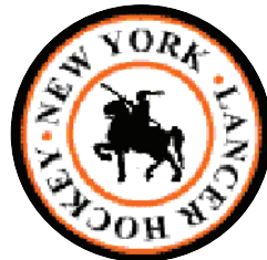
New York Lancers